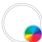
Custom Colour Powder Coated Steel