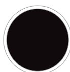
Black Powder Coated Steel